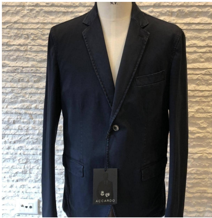
Men's Casual Jacket

Enhance your boutique's clothing selection with our stunning collection of mandarin collar shirts. Exuding elegance and versatility, our shirts Colors: bianco,nero,rosso,arancione,lime,marrone,blu,azzurro Sizes: 42,44,46,48,50,52,54,56,58,60,62,64,66 / Spring Summer