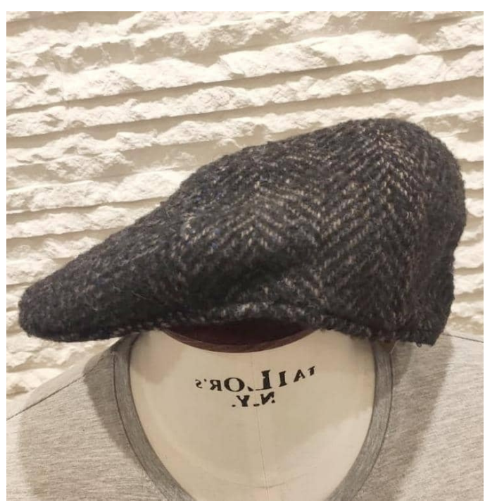
Classic men's flat cap

Enhance your accessory collection with our Italian designed flat cap. Crafted with precision and a flair for fashion, this piece blends timeless Colors: nero,blu,bianco,rosso,arancione,verde,viola,marrone,azzurro Sizes: S,L,M,XL,XXL / Spring Summer