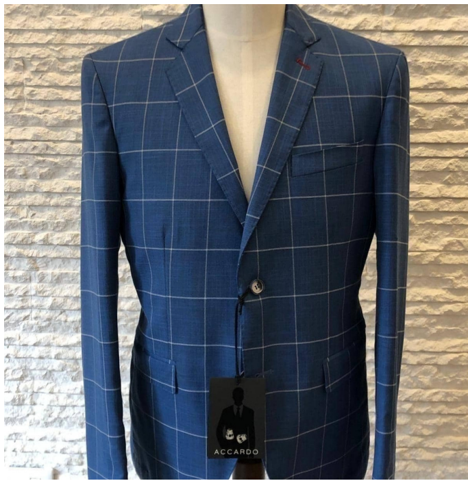
Men's Casual Jacket

Discover our classic patch jacket expertly crafted in Italy, exuding sophistication and style for the modern professional.Product Colors: nero,blu,grigio,marrone,cammello,bordeaux,viola,verdone Sizes: 42,44,46,48,50,52,54,56,58,60,62,64,66,68,70 / All Seasons