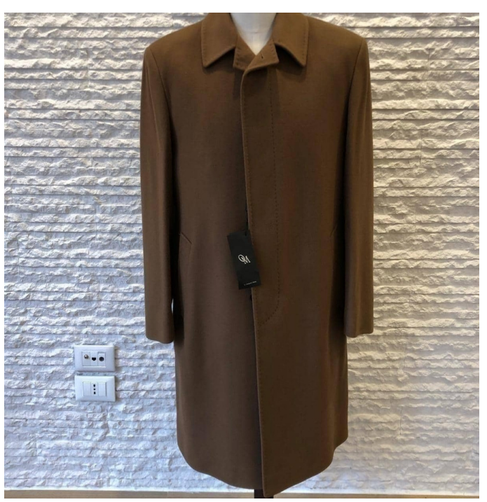
Elegant Wool Coat