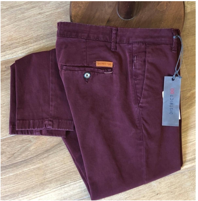
Elegant Burgundy Chinos