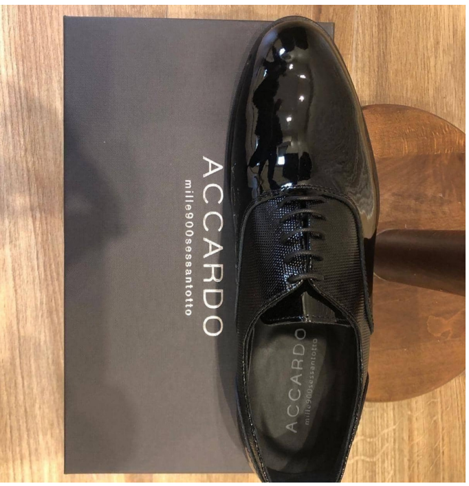
Classic Men's Shoe

Indulge in the sartorial elegance of our Italian-crafted Burgundy Chinos, a must-have for the discerning fashion reseller. Crafted with Colors: bianco,nero,azzurro,verde,panna,grigio,bluette,arancione,vio Sizes: 42,44,46,48,50,52,54,56,58,60,62,64,66,68,70 / All Seasons