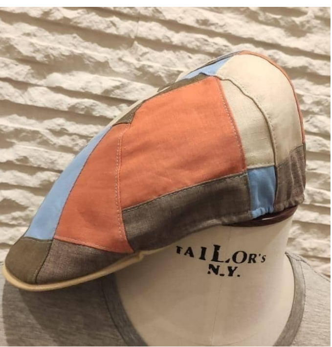
Casual men's cap

Enhance your accessory collection with our Italian designed flat cap. Crafted with precision and a flair for fashion, this piece blends timeless Colors: nero,marrone,bordeaux,verdone,blu,rosso,viola,grigio Sizes: S,M,L,XL,XXL / Fall Winter