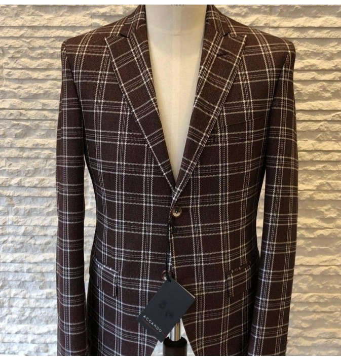
Men's Casual Jacket