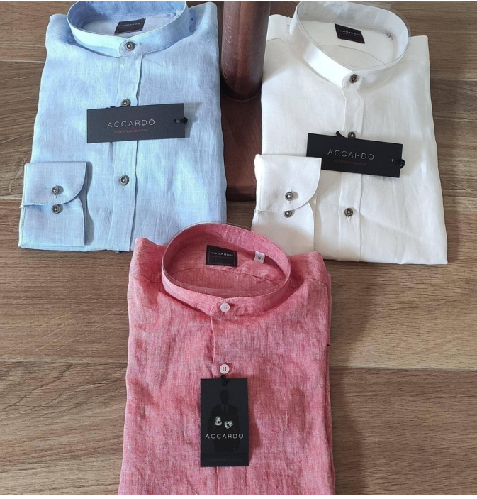
Korean collar shirt

Discover our classic unlined jacket expertly crafted in Italy, exuding sophistication and style for the modern professional. Product Colors: bianco,nero,grigio,bordeaux,verdone,verde, Sizes: 42,44,46,48,50,52,54,56,58,60,62,64,66,68,70 / Spring Summer