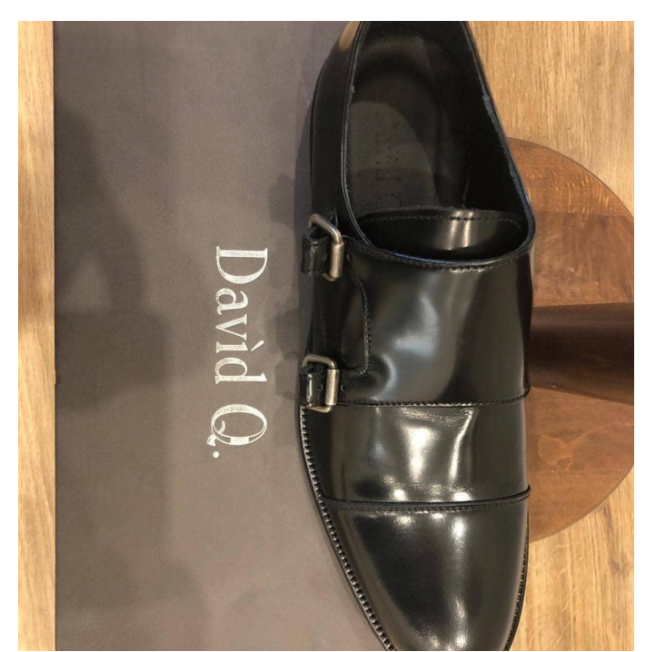
Double Buckle Men's Shoe

Colors: nero Sizes: 39,40,41,42,43,44,45