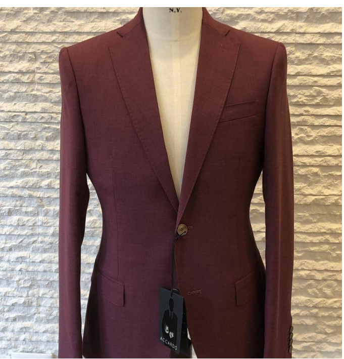
Classic Men's Jacket

Exude sophistication with our maroon-hued tailored trousers, meticulously crafted in Italy, where timeless elegance meets modern Colors: nero,blu,grigio,marrone,bordeaux,bianco Sizes: 42,44,46,48,50,52,54,56,58,60,62,64,66,68,70