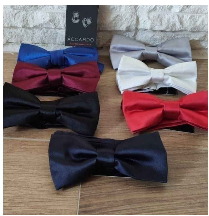
Classic Men's Bow Tie

Sizes: 42,44,46,48,50,52,54,56,58,60,62,64,66,68,70 / All Seasons