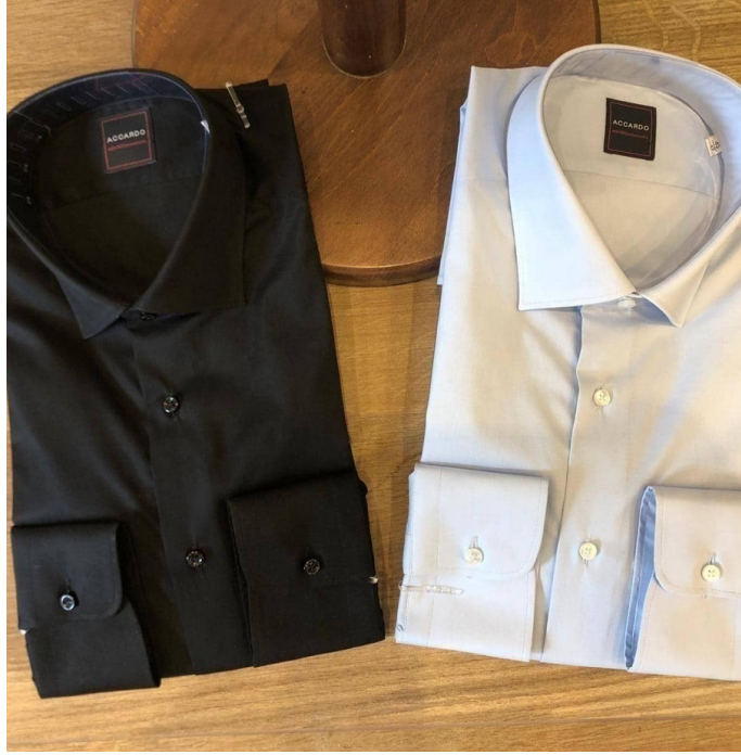
Classic Men's Shirts

Colors: nero Sizes: 39,40,41,42,43,44,45 / All Seasons