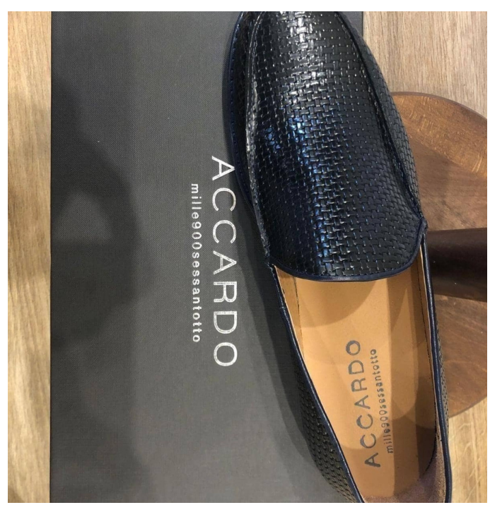
Casual Men's Moccasin

Colors: nero Sizes: 39,40,41,42,43,44,45