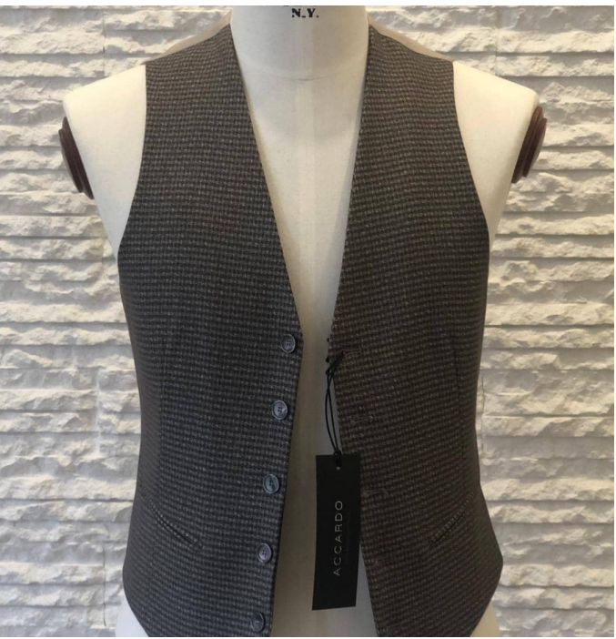
Classic Men's Vest

Enhance your store's clothing collection with our chic Italian-designed wool and cashmere coat, setting a benchmark in luxury outerwear. Colors: nero,blu,grigio,marrone,cammello Sizes: 42,44,46,48,50,52,54,56,58,60,62,64,66,68,70 / Fall Winter