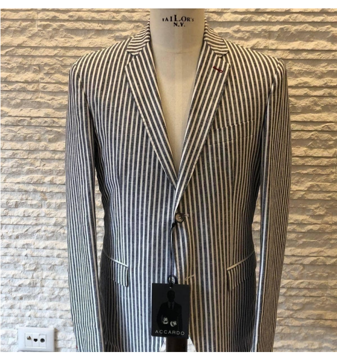
Lightweight men's jacket