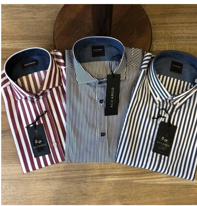
Classic Men's Shirts

Sizes: 39,40,41,42,43,44,45 / All Seasons