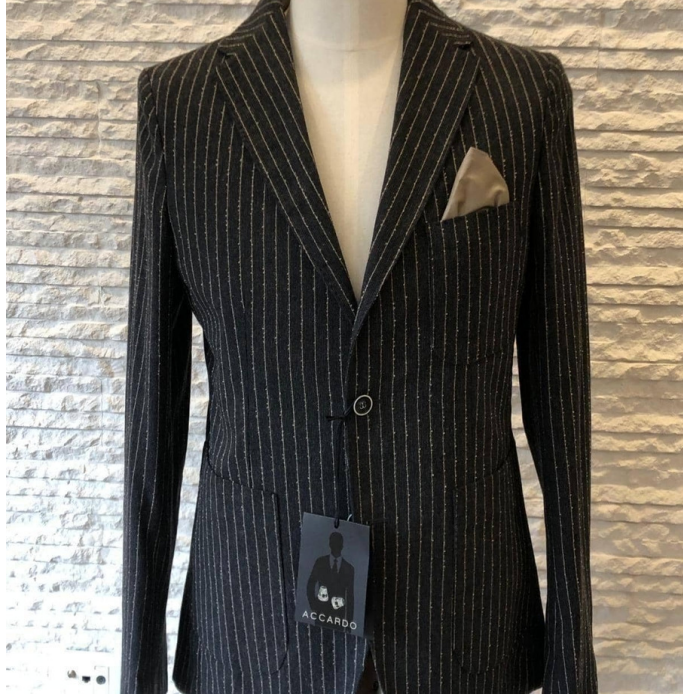
Classic Pinstripe Jacket

Discover our classic jacket expertly crafted in Italy, exuding sophistication and style for the modern professional. Product Colors: nero,blu,grigio,marrone,cammello,bordeaux,verde,rosso,avorio Sizes: 42,44,46,48,50,52,54,56,58,60,62,64,66,68,70 / All Seasons