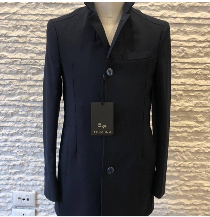
Slim Men's Trench Coat

Enhance your store's clothing collection with our chic Italian-designed polyester trench coat, setting a benchmark in luxury outerwear. Colors: nero,blu,grigio,marrone,bianco Sizes: 42,44,46,48,50,52,54,56,58,60,62,64,66,68,70 / Spring Summer