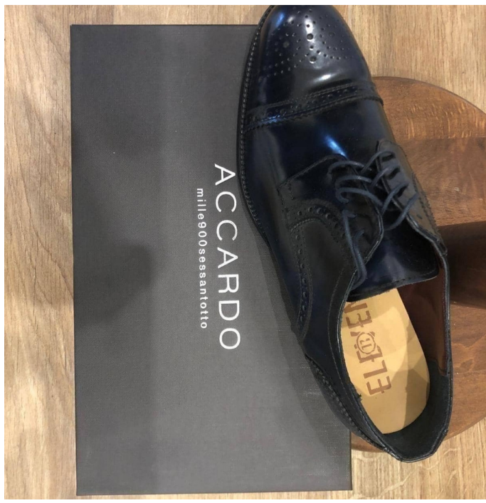
Elegant Oxford Shoe

Enhance your boutique's clothing selection with our stunning collection of Italian striped shirts. Exuding elegance and versatility, our shirts are Colors: bianco,nero,blu,celeste Sizes: 42,44,46,48,50,52,54,56,58,60,62,64,66 / All Seasons