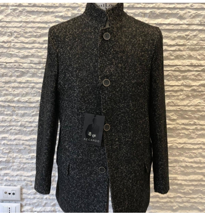
Men's Casual Coat

Enhance your store's clothing collection with our chic Italian-designed wool and cashmere overcoat, setting a benchmark in luxury Colors: nero,blu,grigio,marrone,cammello Sizes: 42,44,46,48,50,52,54,56,58,60,62,64,66,68,70 / Fall Winter