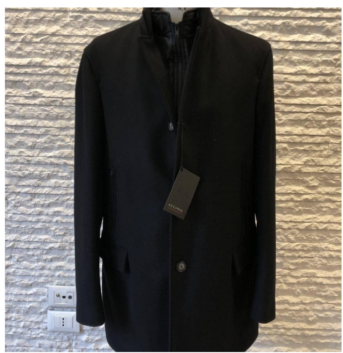
Casual Men's Coat

Enhance your boutique collection with our premium Italian leather jacket, a timeless piece for any discerning wardrobe. Product Colors: nero,blu,grigio,marrone,bianco,verde,rosso Sizes: 42,44,46,48,50,52,54,56,58,60,62,64,66,68,70 / All Seasons