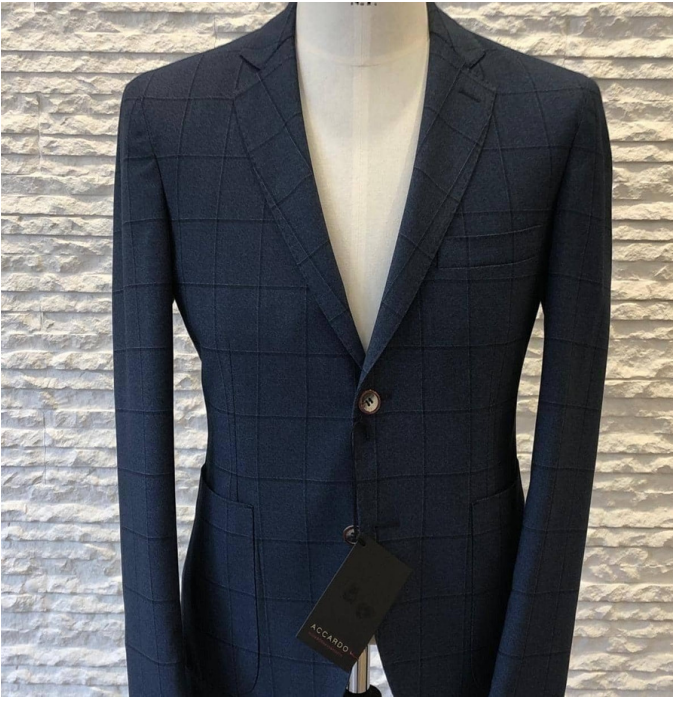
Men's Casual Jacket

Discover our classic unlined jacket expertly crafted in Italy, exuding sophistication and style for the modern professional.Product Colors: nero,blu,grigio,marrone,cammello,beige,panna,bordeaux Sizes: 42,44,46,48,50,52,54,56,58,60,62,64,66,68,70 / All Seasons