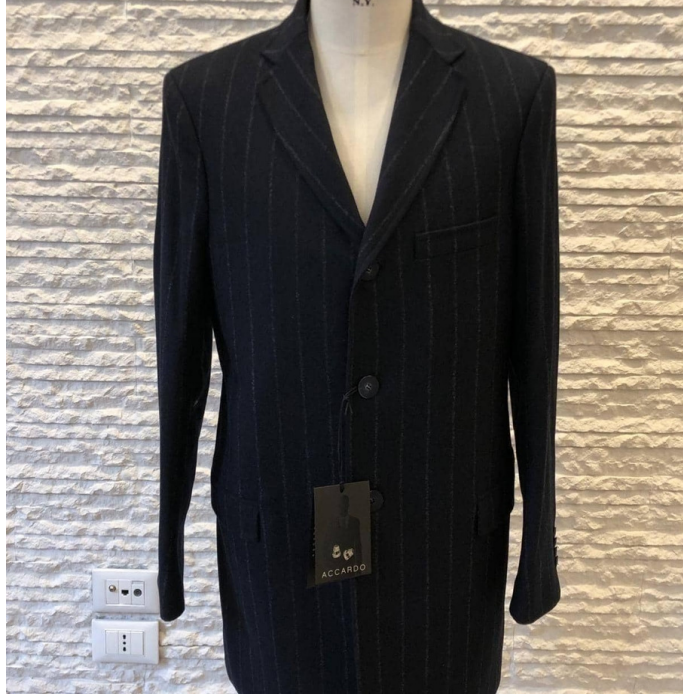
Men's Pinstripe Coat

Enhance your store's clothing collection with our chic Italian-designed wool and cashmere coat, setting a benchmark in luxury outerwear. Colors: nero,blu,grigio,marrone,cammello Sizes: 42,44,46,48,50,52,54,56,58,60,62,64,66,68,70 / Fall Winter