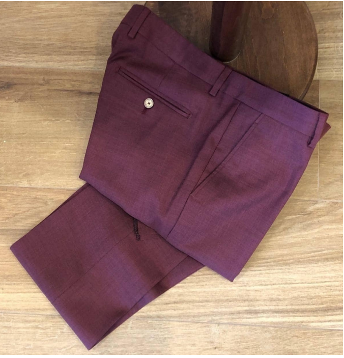
Elegant Maroon Trousers

Enhance your store's clothing collection with our chic Italian-designed polyester trench coat, setting a benchmark in luxury outerwear. Colors: nero,blu,grigio,marrone,bianco Sizes: 42,44,46,48,50,52,54,56,58,60,62,64,66,68,70 / Spring Summer