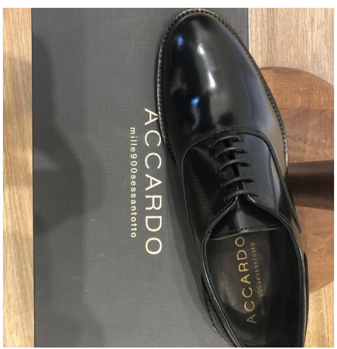
Classic Men's Shoe

Discover timeless elegance with our handcrafted Italian leather Suede shoes, meticulously designed to provide the perfect combination of Colors: marrone Sizes: 39,40,41,42,43,44,45 / All Seasons