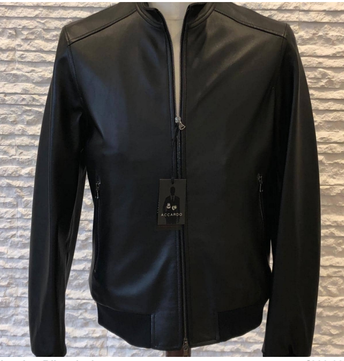
Leather Biker Jacket

Discover the epitome of luxury with our Italian-crafted wool coat. The embodiment of elegance meets functionality in this timeless piece, Colors: nero,blu,grigio,marrone,cammello Sizes: 42,44,46,48,50,52,54,56,58,60,62,64,66,68,70 / Fall Winter