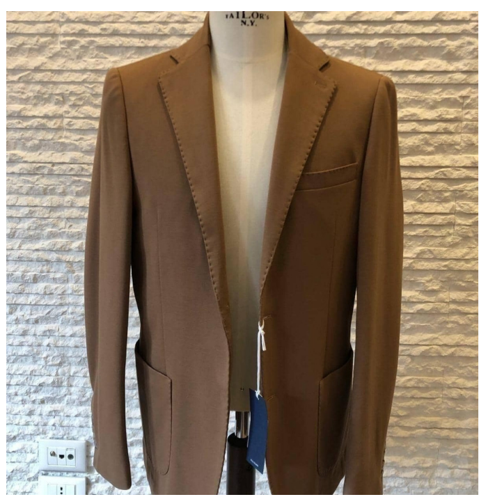
Men's Casual Jacket

Discover our classic unlined jacket expertly crafted in Italy, exuding sophistication and style for the modern professional.Product Colors: nero,blu,grigio,marrone,cammello,bordeaux,celeste,verde,viol Sizes: 42,44,46,48,50,52,54,56,58,60,62,64,66,68,70 / All Seasons