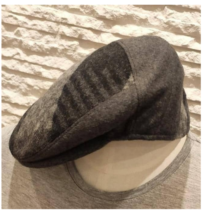
Classic men's flat cap

Enhance your outfit with our elegant Italian leather belts, crafted to perfection with a commitment to quality and style. These belts are a Colors: nero,testa di moro Sizes: 105,110,115,120,125,130 / All Seasons