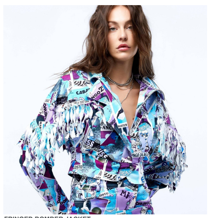
FRINGED BOMBER JACKET

The tube silhouette of this miniskirt embraces feminine curves. Wearable for a daytime outfit or a night out. In the iconic "Yves Uro Colors: "Yves Uro Tribute" Print Sizes: XS,S,M,L / All Seasons