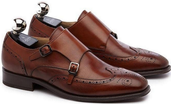
Made in Italy Shoes Made in Italy leather Shoes