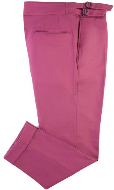
Sartorial Trousers Sartorial Trousers