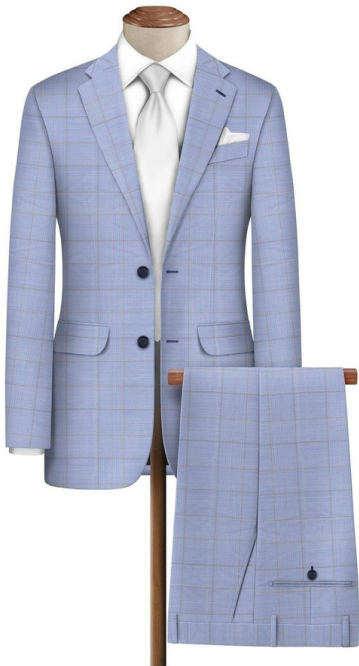
Sartorial Suit Sartorial Suit