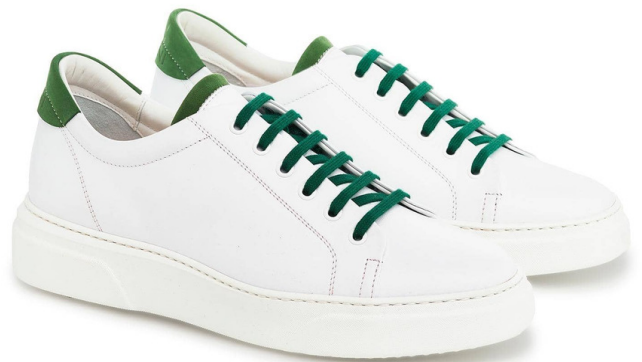
Made in Italy Sneakers Made in Italy Sneakers