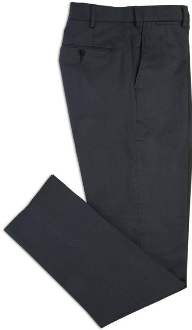
Sartorial Trousers Sartorial Trousers