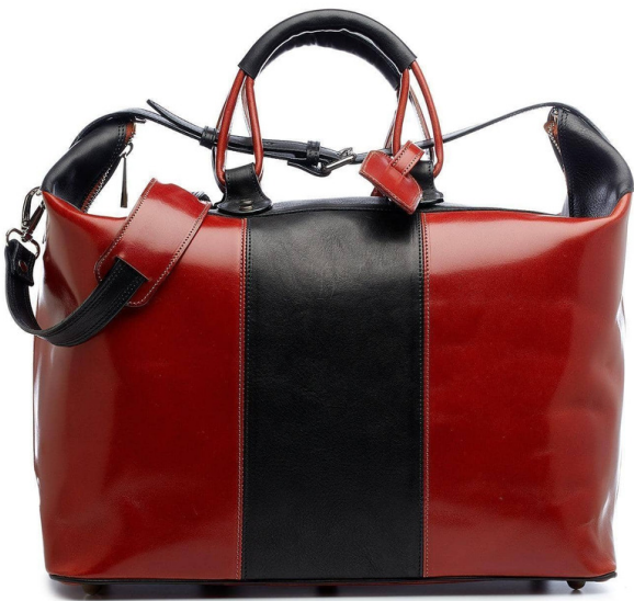
Made in Italy Travel Bag Made in Italy leather Travel Bag