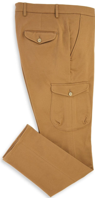
Leisure Trousers Leisure Trousers