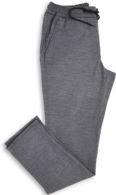
Leisure Trousers Leisure Trousers with coulisse