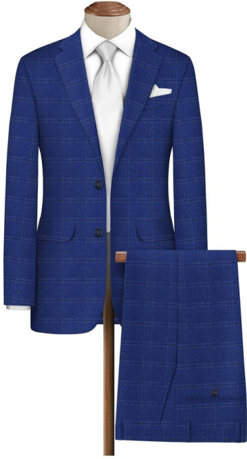
Sartorial Suit Sartorial Suit