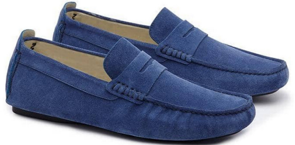
Made in Italy Car Shoe Made in Italy Car Shoe