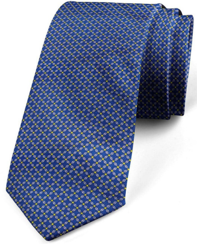
Made in Italy Tie Made in Italy 100% silk Tie