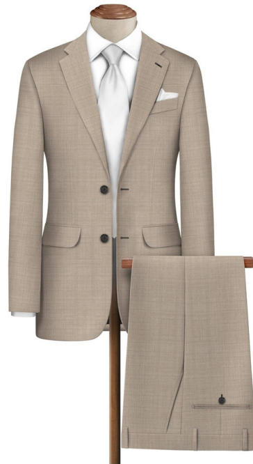
Sartorial Suit Sartorial Suit