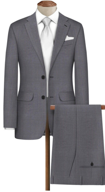
Formal Suit Made in Italy Suit Fall Winter