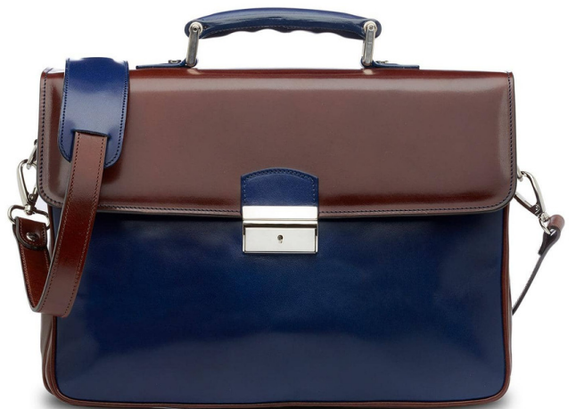
Made in Italy Bag Made in Italy Business bag realized in leather