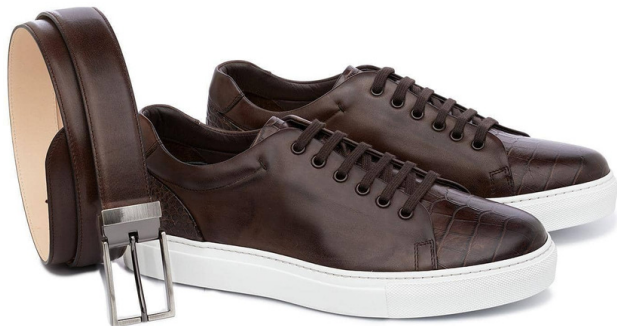
Made in Italy Sneakers Made in Italy Sneakers and belt