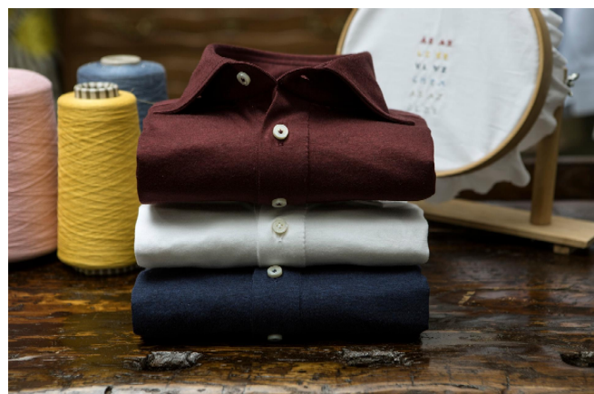
POLO SHIRT by hand : Polo Shirt high quality fabrics short sleeve Wholesale price: 60.00 EUR