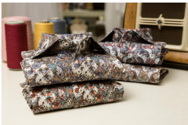
LIMITED EDITION SHIRT : Limited Edition shirt exclusive design Cordone1956, Available more 500 fabrics in stock Wholesale price: 45.00 EUR