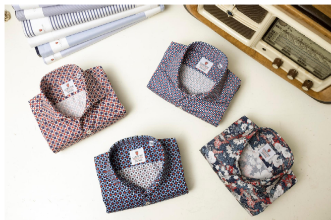
LIMITED EDITION SHIRT : Limited Edition shirt exclusive design Cordone1956, Available more 500 fabrics in stock Wholesale price: 50.00 EUR