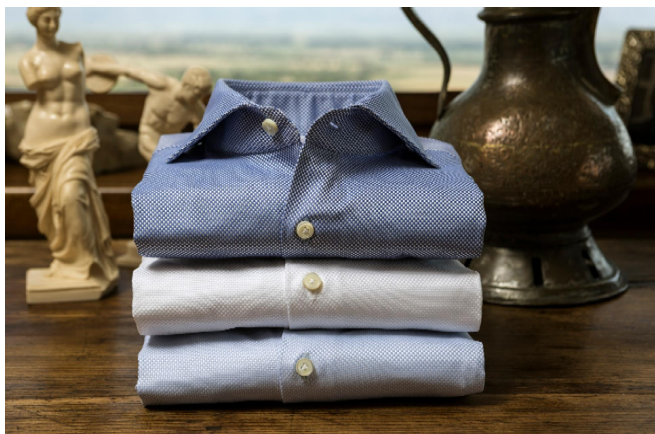
CLASSIC SHIRT : Classic shirt available in 500 type of fabrics all time in stock Wholesale price: 45.00 EUR