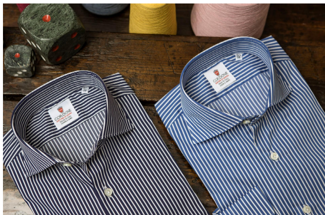
SHIRT CLASSIC : Shirt limited edition available in 500 different fabrics Wholesale price: 52.00 EUR