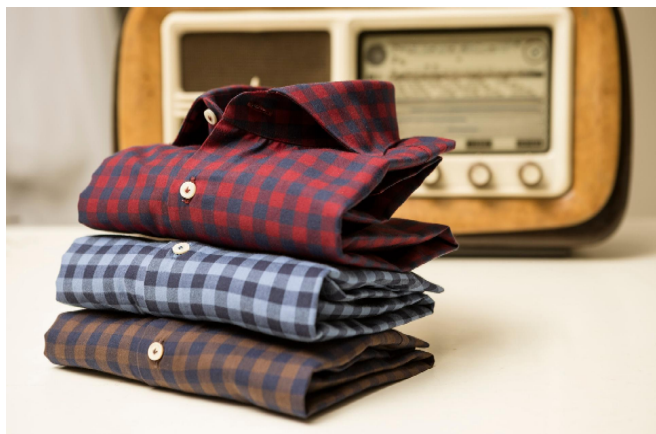
FLANELL SHIRT : Flanell shirt handmade in Italy Wholesale price: 50.00 EUR