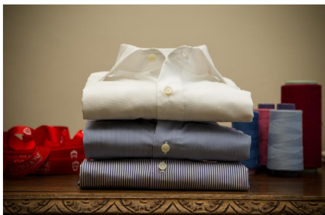
SHIRT CLASSIC : Shirt limited edition available in 500 different fabrics Wholesale price: 52.00 EUR