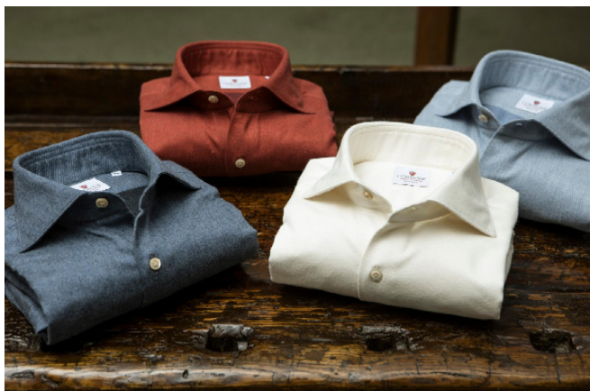
FLANELL SHIRT : Shirt linen available in 500 different fabrics Wholesale price: 50.00 EUR