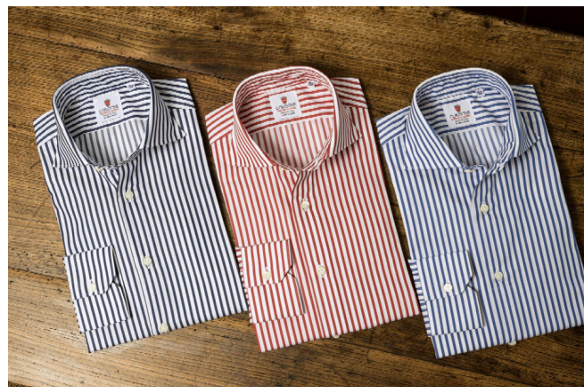
CLASSIC SHIRT : Classic shirt available in 500 type of fabrics all time in stock Wholesale price: 52.00 EUR