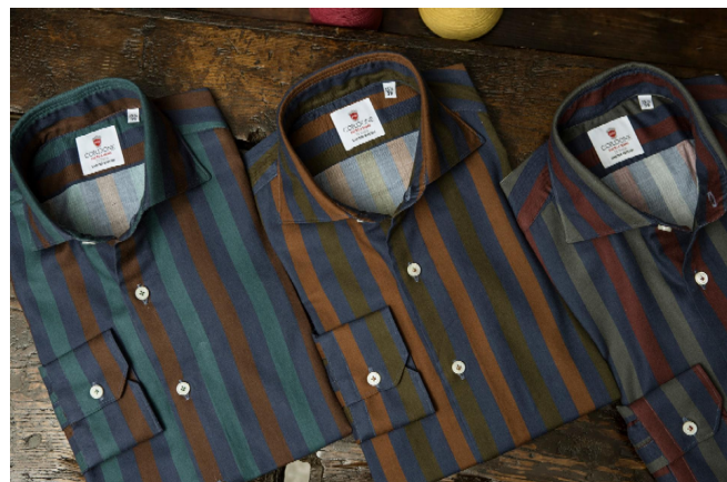
LIMITED EDITION SHIRT : Limited Edition shirt exclusive design Cordone1956, Available more 500 fabrics in stock Wholesale price: 50.00 EUR