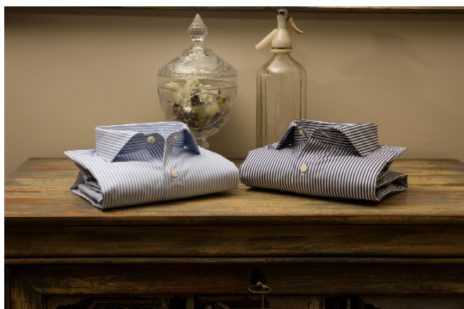
BASIC COLLECTION : Basic collection #Cordone1956 is the shirt ready to ship with the premium fabrics handmade in Italy Wholesale price: 39.00 EUR