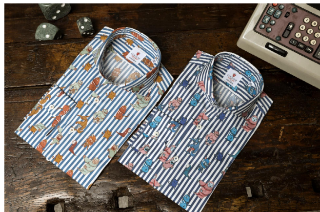
LIMITED EDITION SHIRT : Limited Edition shirt exclusive design Cordone1956, Available more 500 fabrics in stock Wholesale price: 50.00 EUR