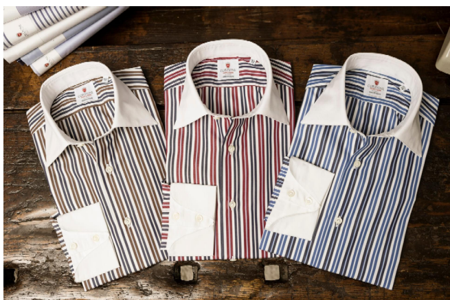
CLASSIC SHIRT : Classic shirt available in 500 different fabrics Wholesale price: 45.00 EUR