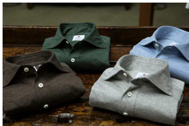
POLO SHIRT BY HAND : Polo Shirt by hand in fine jersey 120/2 Wholesale price: 55.00 EUR