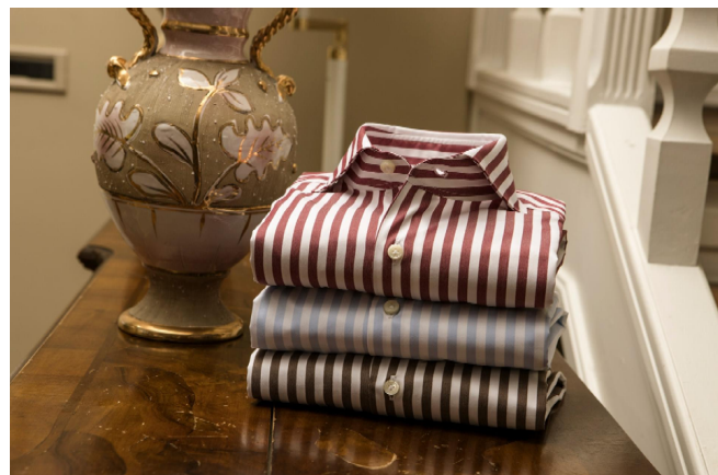
CLASSIC SHIRT : Classic shirt available in 500 type of fabrics all time in stock Wholesale price: 45.00 EUR