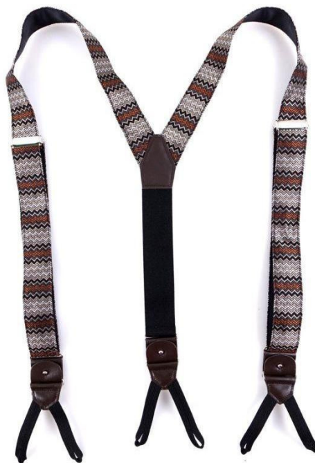
HYBRID SILK SUSPENDERS : HIGH QUALITY HYBRID SILK SUSPENDERS (BRACES) WITH LACES AND CLIPS (AVAILABILITY OF SPARE PARTS IN ORDER TO MACTH DIFFERENT