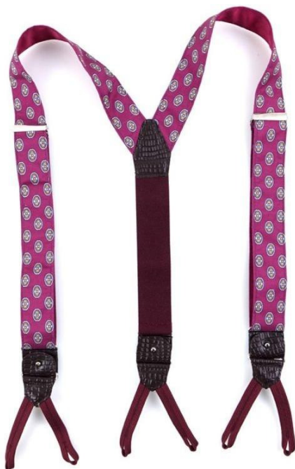
HYBRID SILK SUSPENDERS : HIGH QUALITY HYBRID FABRIC SUSPENDERS (BRACES) WITH LACES AND CLIPS (AVAILABILITY OF SPARE PARTS IN ORDER TO MACTH