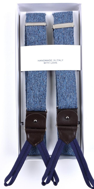
FABRIC SUSPENDERS : HIGH QUALITY FABRIC SUSPENDERS (BRACES) WITH LACES AND CLIPS (AVAILABILITY OF SPARE PARTS IN ORDER TO MATCH DIFFERENT COLOURS OR