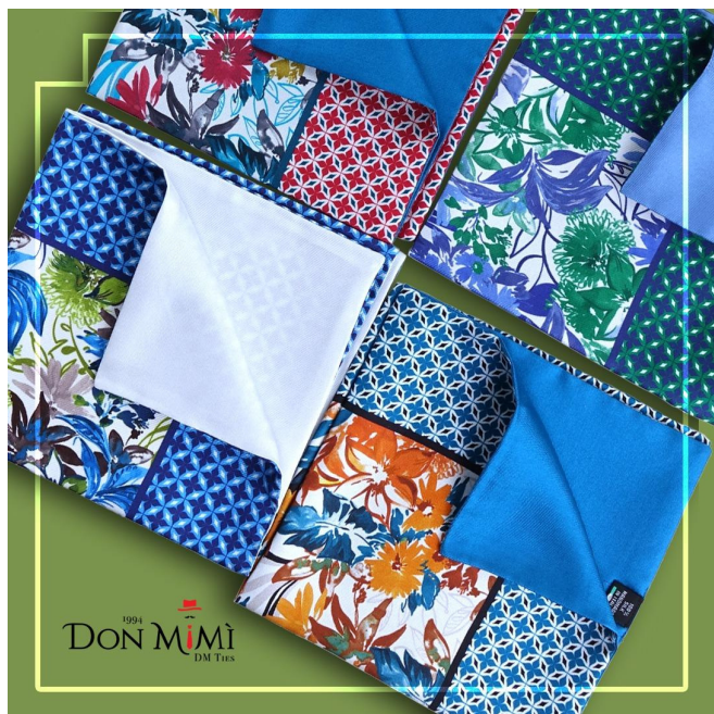
DOUBLE-FACE P-SQUARE : DOUBLE-FACE SILK POCKET SQUARES 33X33 CM - EVERY POCKET SQUARE IS 4 IN 1: YOU CAN CHOOSE WHICH FACE SHOWING OR ONE MORE THAN

A selection of superb men's fashion accessories, handmade in Italy by master artisans, including scarves, silk pocket squares, suspenders, pins. For resellers only.