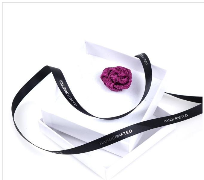
JACKET BOUTONNIERE BOX : JACKET SILK BOUTONNIERE BOX

A selection of superb men's fashion accessories, handmade in Italy by master artisans, including scarves, silk pocket squares, suspenders, pins. For resellers only.