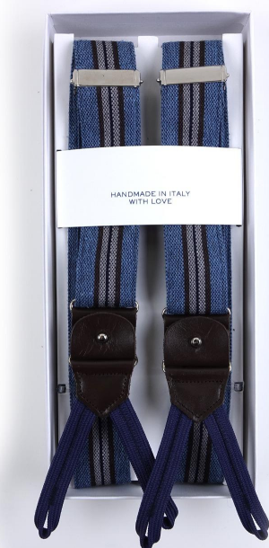
FABRIC SUSPENDERS : HIGH QUALITY FABRIC SUSPENDERS (BRACES) WITH LACES AND CLIPS (AVAILABILITY OF SPARE PARTS IN ORDER TO MATCH DIFFERENT COLOURS OR

A selection of superb men's fashion accessories, handmade in Italy by master artisans, including scarves, silk pocket squares, suspenders, pins. For resellers only.