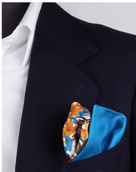
DOUBLE-FACE P-SQUARE : DOUBLE-FACE SILK POCKET SQUARE 33X33 CM - TWILL SILK - 4 POCKET SQUARES IN 1: YOU CAN CHOOSE WHICH FACE SHOWING OR ONE MORE THAN