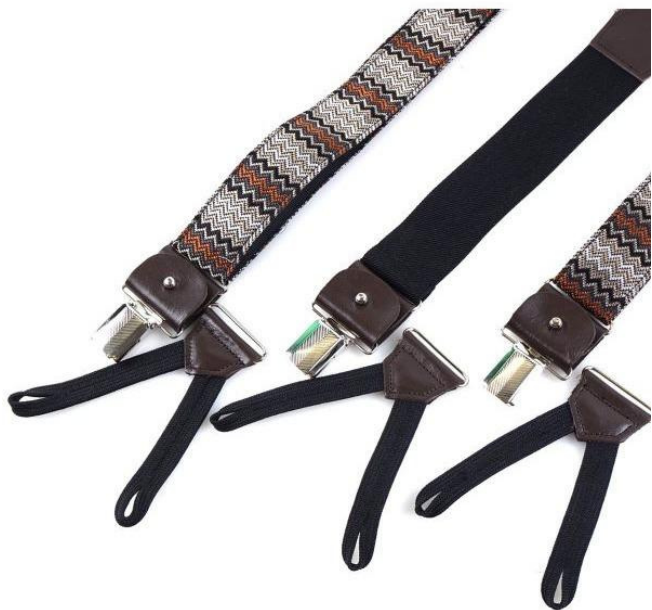
HYBRID BRACES CONNECTIONS : LACES WITH LEATHER SUPPORT + STEEL CLIPS. YOU CAN CHANGE THE 2 SYSTEMS VERY EASILY OR CAN DECIDE TO BUY OTHER SPARE PARTS WITH

A selection of superb men's fashion accessories, handmade in Italy by master artisans, including scarves, silk pocket squares, suspenders, pins. For resellers only.