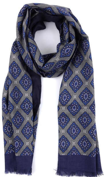
WOOL YAK SCARF : DOUBLE LAYER WOOL SCARF 35X180 CMS - 70%MERINOS WOOL/30%YAK WOOL