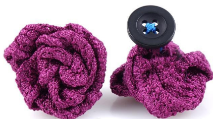
FLOWER LAPEL PIN : SILK FLOWER LAPEL PIN WITH HORN BUTTON