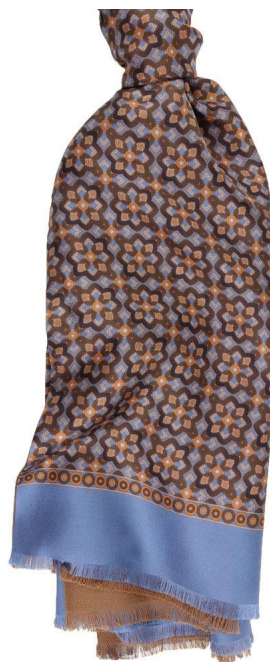
SILK & WOOL SCARF : DOUBLE LAYER SCARF 35X180 CMS - 50%WOOL/50%SILK