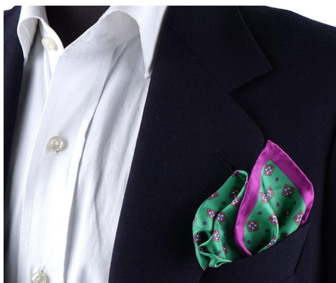
POCKET SQUARE : SILK POCKET SQUARE 33X33 CM