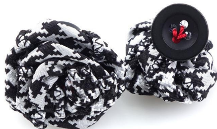
JACKET BOUTONNIERE : HANDMADE JACKET SILK BOUTONNIERE WITH HORN BUTTON