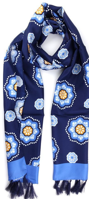
SILK SCARF WITH TASSELS : SILK SCARF WITH (OR WITHOUT) TASSELS 45X180 CMS