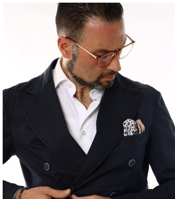
DOUBLE-FACE P-SQUARE : DOUBLE-FACE SILK POCKET SQUARE 33X33 CM - TWILL SILK - 4 POCKET SQUARES IN 1: YOU CAN CHOOSE WHICH FACE SHOWING OR ONE MORE THAN