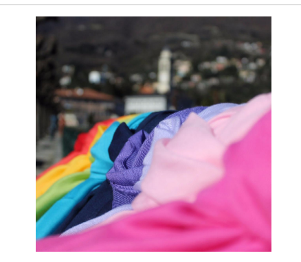
Plain articles : the strenght of colors, the strenght of simplicity.