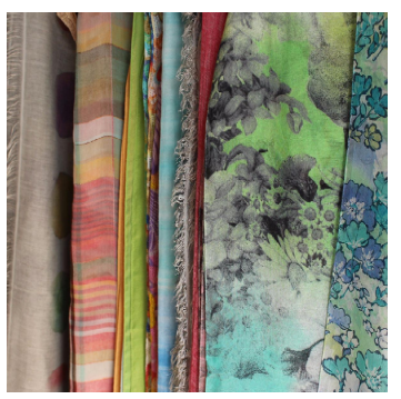
Our choice : we offer high quality products entirely Made in Italy.