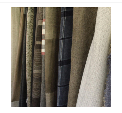
Neutral colors : a timeless feel for an elegant collection.