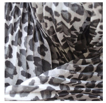
Our expertise : unique scarves in style and technology.

Lovely details : both retro and distincly modern.