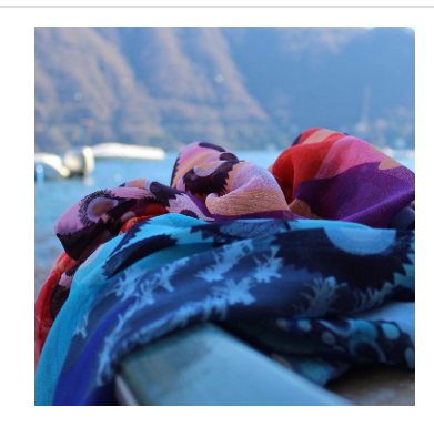
Our know-how : technological knowledge of the silk industry in Como.