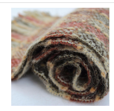
Our selection : an astounding range to high quality fashion accessories.