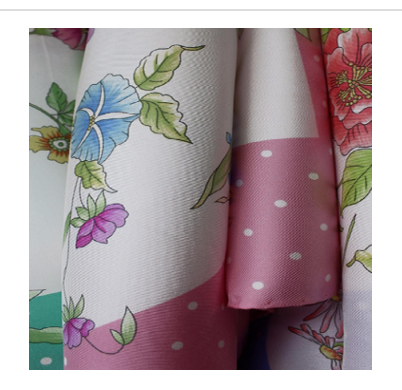
Great designs : delicate blossoms with an emphasis on pastel tones.