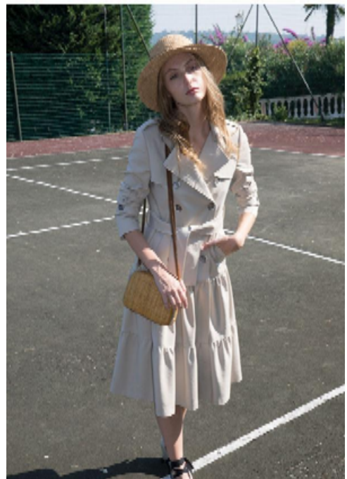
Trench : trench coat with flounces