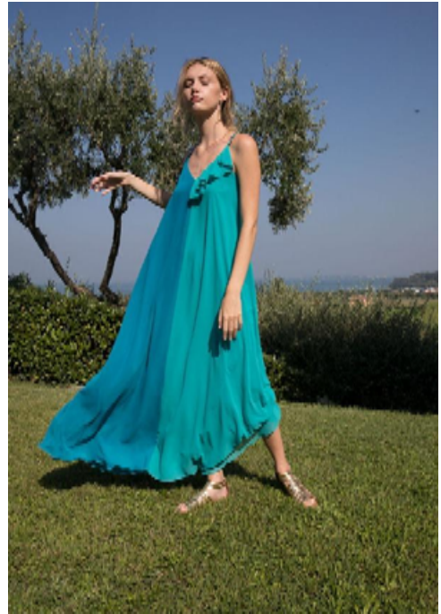
Long dress : Long two-tone dress in georgette