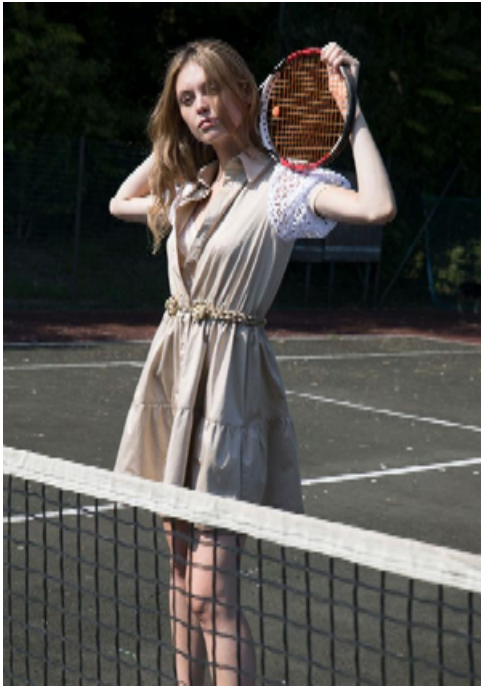
cotton dress : cotton dress with sleeves in San Gallo