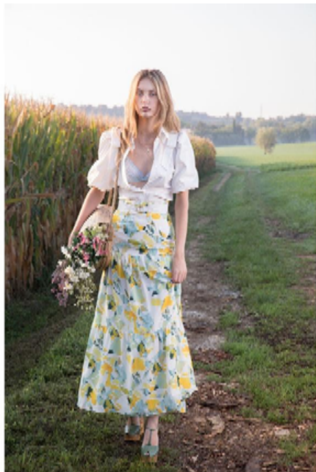
Skirt and shirt : Long patterned skirt with underskirt and cotton shirt with gathered sleeves