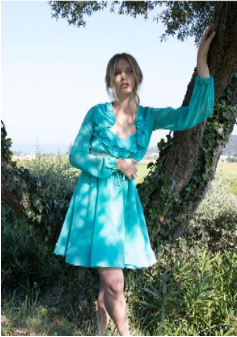
short dress : short dress in georgette with gathered sleeves