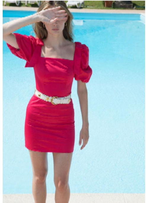
cotton dress : cotton dress with gathered sleeves