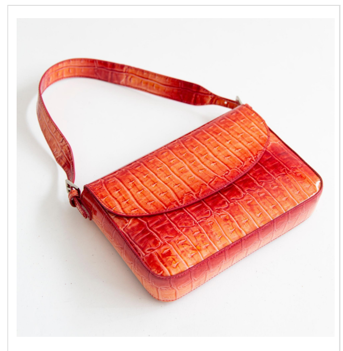
Luxury Croc-Effect Clutch : Explore the epitome of Italian craftsmanship with our exquisite croc-print leather clutch. Perfect for sophisticated boutiques and luxury gift shops. Product Description: -