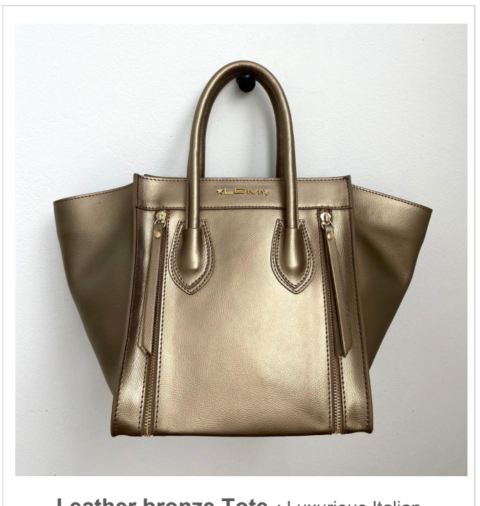
Leather bronze Tote: Luxurious Italian Craftsmanship: - Tailored with premium quality leather for durability and a sleek finish. - Elegant metallic sheen exudes a sophisticated charm. Target