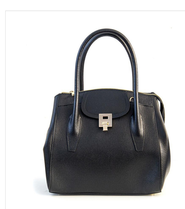
Saffiano Leather Tote : Elevate your boutique's collection with our Italian-crafted Elegant Leather saffiano Tote, designed to offer both style and functionality. A sophisticated choice for the