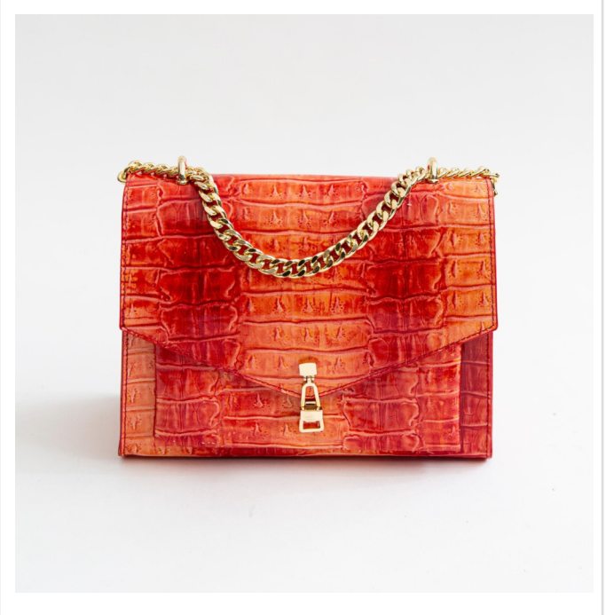
Print leather Croco Bag : Product Description: • Exquisite Italian craftsmanship showcases the fine details of the textured print crocodile effect. • Rich, vibrant red hue makes a bold fashion statement for

LAURA DI MAGGIO | via Sardegna 3c, 20072 Pieve Emanuele (Milano), ITALY +39-0257605988 | lauradimaggio@tiscali.it | https://www.italianmoda.com/storefronts/lauradimaggio