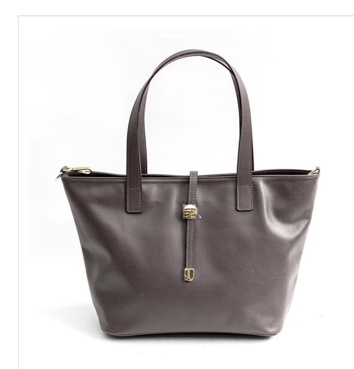
Chic Leather Tote: Elevate your boutique's collection with our exquisite Italian leather shopping bag, meticulously crafted for the fashion-savvy clientele. This versatile piece is an embodiment of