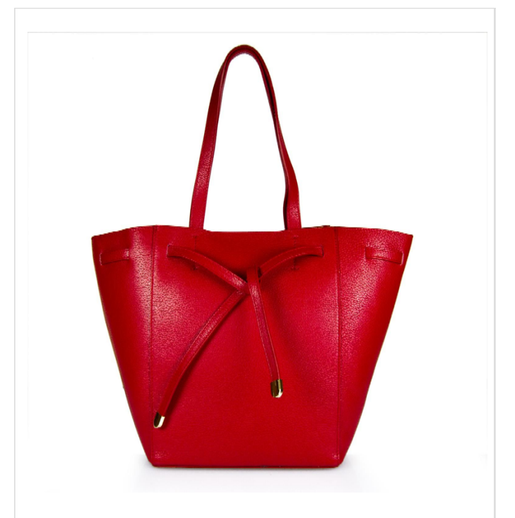
Genuine leather bag. Made: SHOPPER, in genuine dollar leather. Made in Italy Double long handles to be pruned over the shoulder. Closure with two magnetic buttons. Medium zip pocket