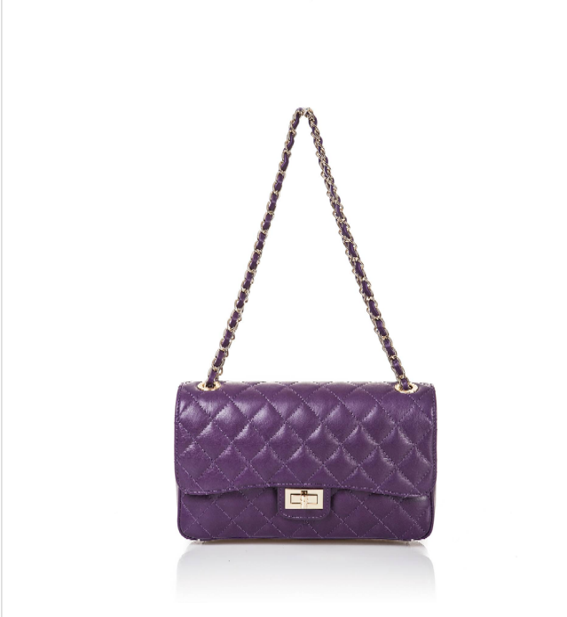
Genuine leather bag. : Genuine leather bag. Made i Italy