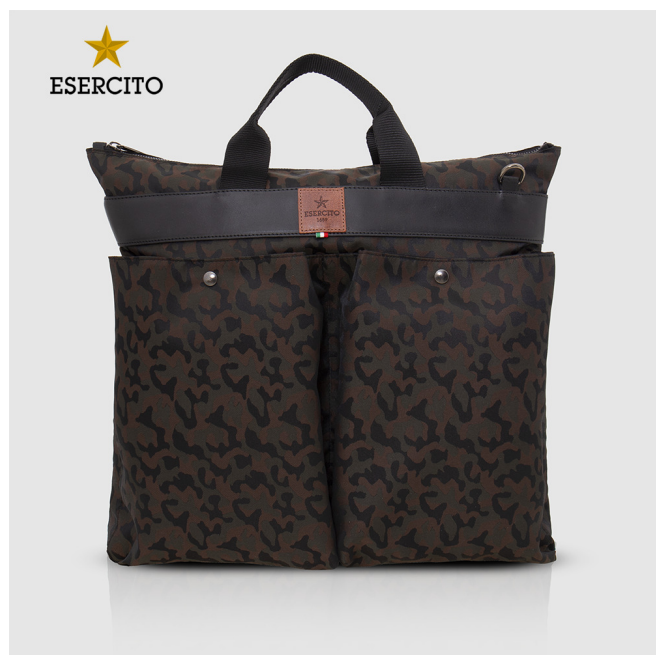
EI 28 MLT V : Shopping bag made of nylon with comfortable pockets for objects and adjustable shoulder strap. Practical and stylish. Dimensions 40 x 44 x 10 cm