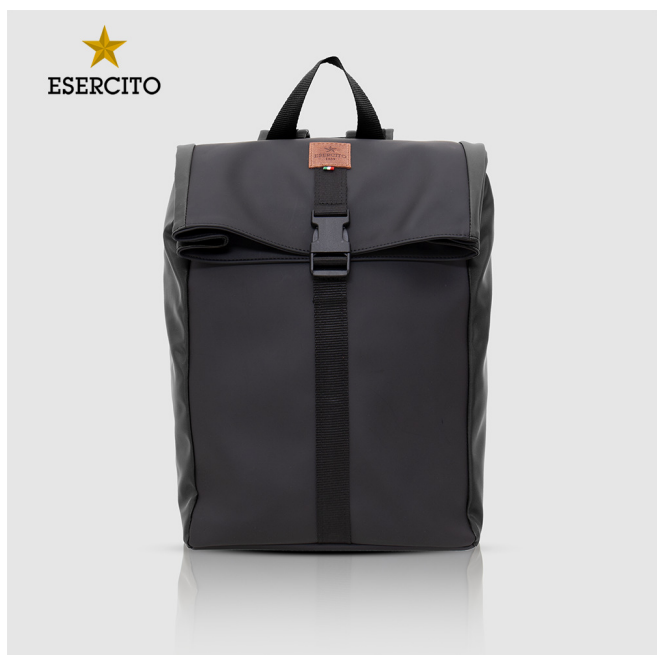
EI 27 NYG N : Backpack for man, made of nylon with adjustable shoulder straps, comfortable and casual. Dimensions 42 x 28 x 15 cm