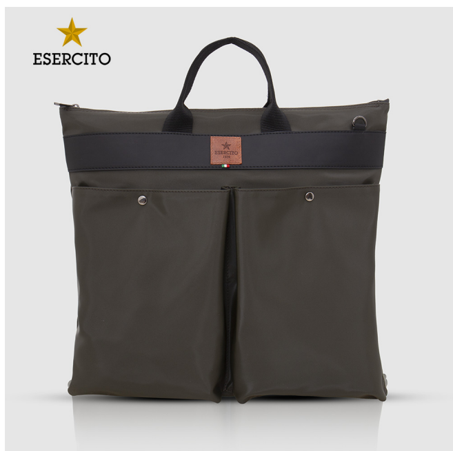
EI 28 NYG V : Shopping bag made of nylon with comfortable pockets for objects and adjustable shoulder strap. Practical and stylish. Dimensions 40 x 44 x 10 cm