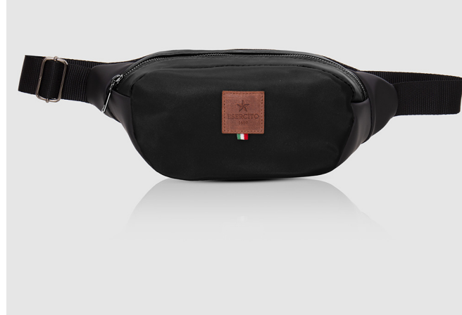
EI 32 NYG N : Waist bag made of nylon fabric available in two colors. Dimensions 15 x 32 x 11 cm