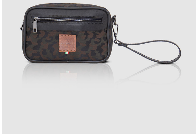
EI 31 MLT V : Men's bag made of practical and fashionable nylon fabric. Detachable sleeve. Dimensions 13 x 20 x 7 cm