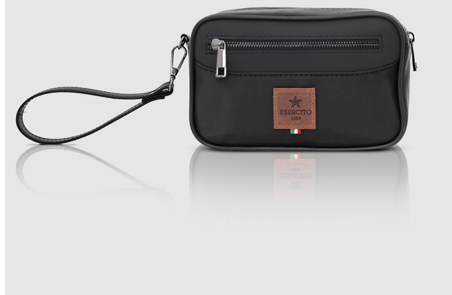
EI 31 NYG N : Men's bag made of practical and fashionable nylon fabric. Detachable sleeve. Dimensions 13 x 20 x 7 cm