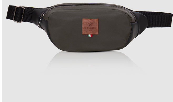
EI 32 NYG V : Waist bag made of nylon fabric available in two colors. Dimensions 15 x 32 x 11 cm