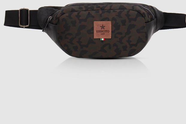
EI 32 MLT V : Waist bag made of nylon fabric available in two colors. Dimensions 15 x 32 x 11 cm