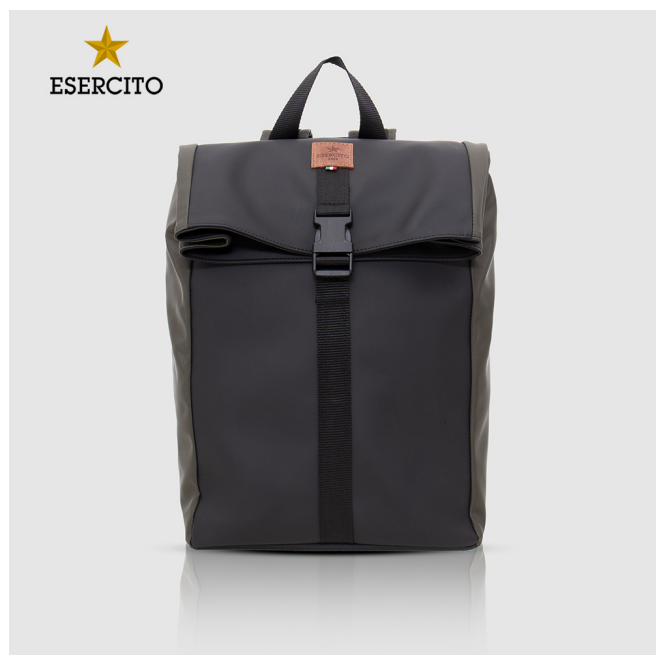
EI 27 NYG V : Backpack for man, made of nylon with adjustable shoulder straps, comfortable and casual. Dimensions 42 x 28 x 15 cm