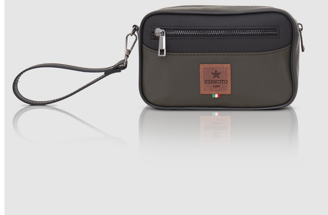
EI 31 NYG V : Men's bag made of practical and fashionable nylon fabric. Detachable sleeve. Dimensions 13 x 20 x 7 cm