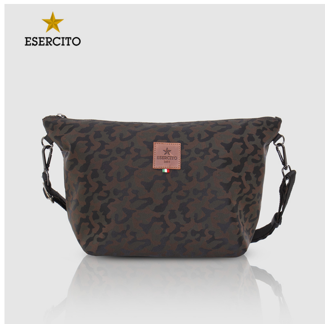
EI 30 MLT V : clutch made of nylon fabric with adjustable shoulder strap. Dimensions 37 x 23 x 14 cm