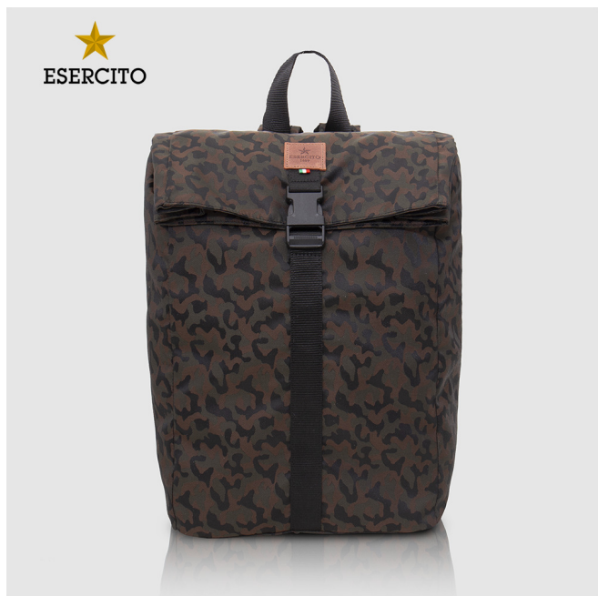
EI 27 MLT V : Backpack for man, made of nylon with adjustable shoulder straps, comfortable and casual. Dimensions 42 x 28 x 15 cm