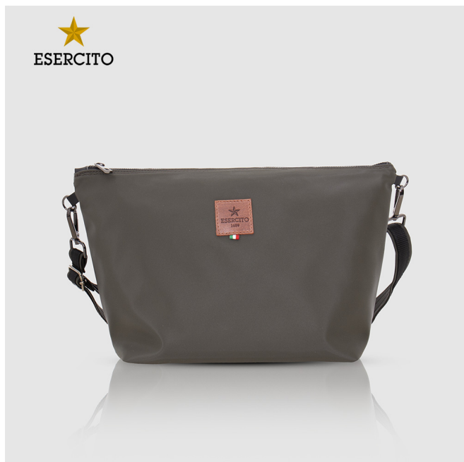
EI 30 NYG V : clutch made of nylon fabric with adjustable shoulder strap. Dimensions 37 x 23 x 14 cm