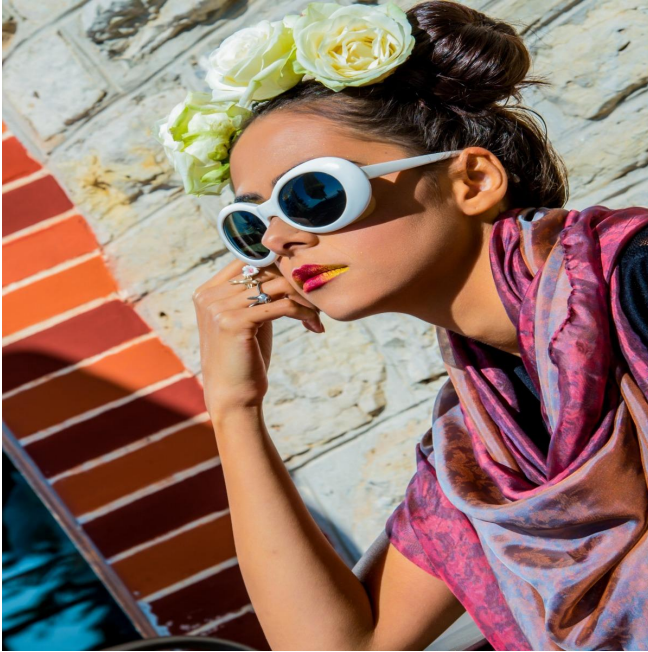
VOPD03 : Pompeii Scarf [Dreamscapes Collection] Wholesale price: 58,00 EUR