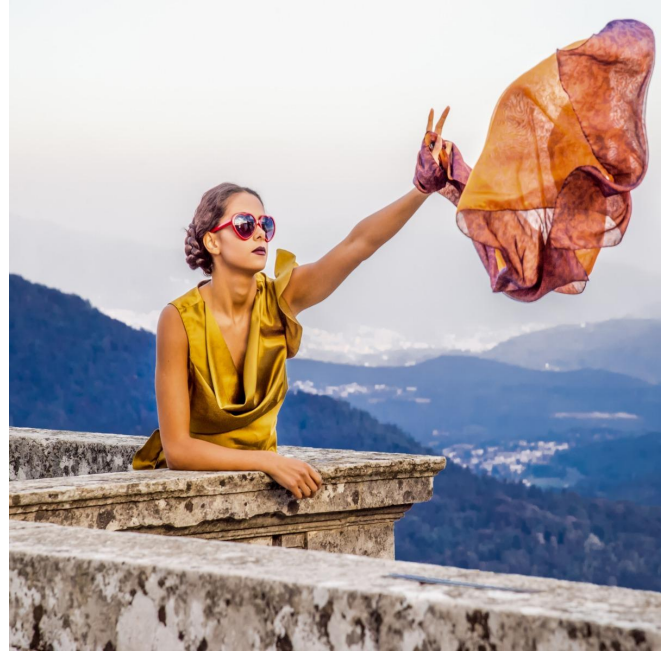
TOF02 : Rome Scarf [Dreamscapes Collection] Wholesale price: 58,00 EUR