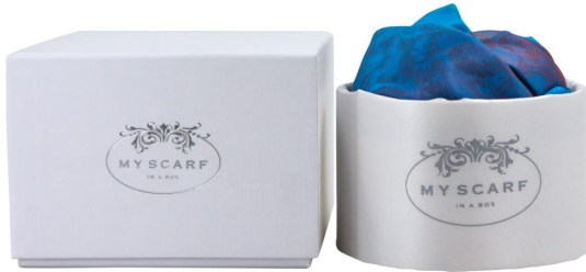
GOND03 : Naples Scarf with it's full packaging [Dreamscapes Collection] Wholesale price: 58,00 EUR