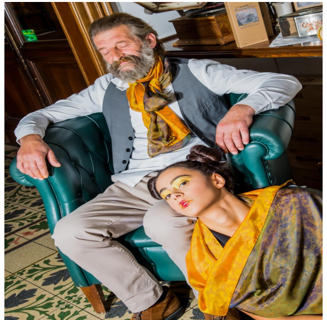
FOA03 : Agrigento Scarf [Dreamscapes Collection] Wholesale price: 58,00 EUR