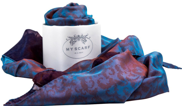
MURD05 : Murano Scarf in it's Tombolino [Dreamscapes Collection] Wholesale price: 58,00 EUR