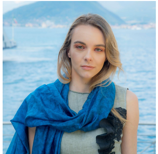
MYCA01 : Cassiopea Scarf [Mythos Collection] Wholesale price: 38,00 EUR