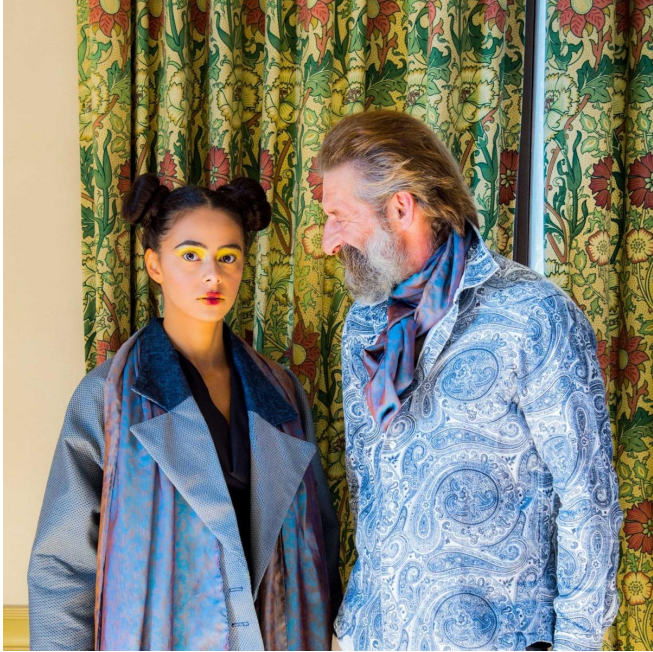
LOVD02 : Verona Scarf [Dreamscapes Collection] Wholesale price: 58,00 EUR