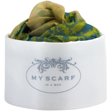
GOGD04 : Bellagio Scarf in it's Tombolino [Dreamscapes Collection] Wholesale price: 58,00 EUR