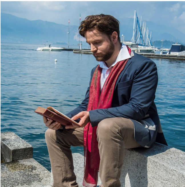
MYAU01 : Aura Scarf [Mythos Collection] Wholesale price: 38,00 EUR