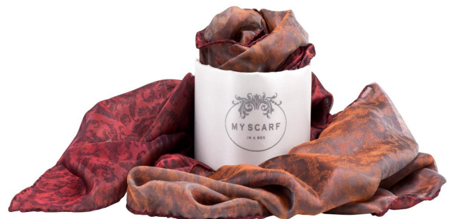
PVD04 : Pompeii Scarf in it's Tombolino [Dreamscapes Collection] Wholesale price: 58,00 EUR