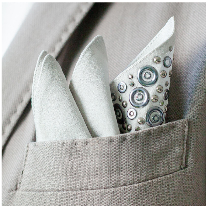
Pocket Square Bubbles : Pocket Square Bubbles. The upper angle has been decorated with hotfix studs and eyelets all positioned piece per piece by hand. Wholesale price: 22,00 EUR