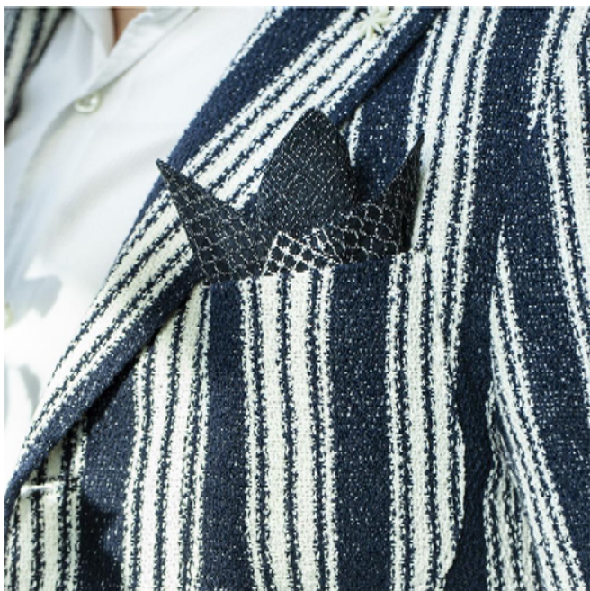
Pocket Square Scribble bl : Pocket Square in embroidered silk with patterns that simulate absent-minded scribbles. Wholesale price: 32,00 EUR