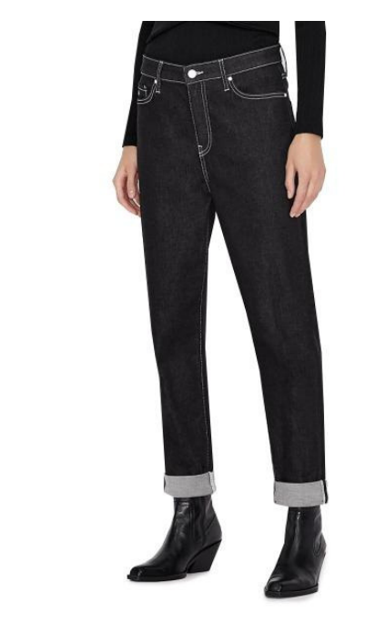
ARMANI JEAN : Product Description - Sleek black denim with a sophisticated silhouette. - Rolled cuffs add a touch of effortlessly chic style. - Perfect for a day-to-night transition. Target Customers and

ARMANI DRESS : Product Description: -Sophisticated black shorts infused with subtle shimmering details. - Tailored for versatility, providing an effortlessly chic look. - Perfectly balanced for both